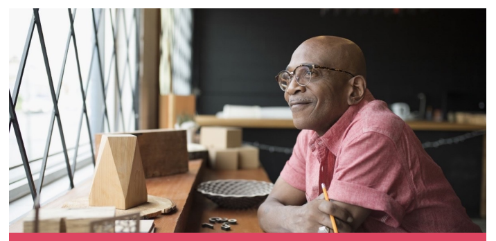
Comfortable With Trying Out New Things