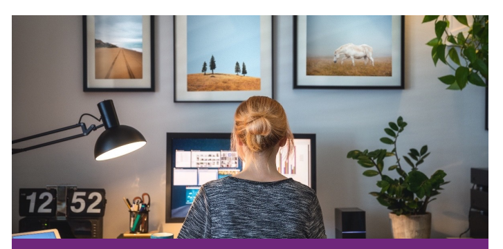
Multiple Opportunities , Less Hesitation to Switch Jobs

Considerations that influence long and short-term strategy