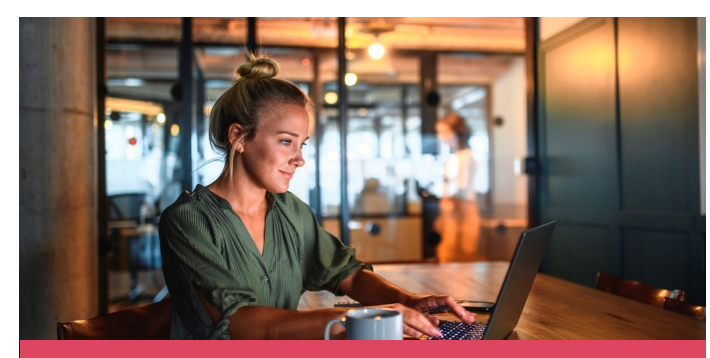
Flexibility in Location and Working Hours